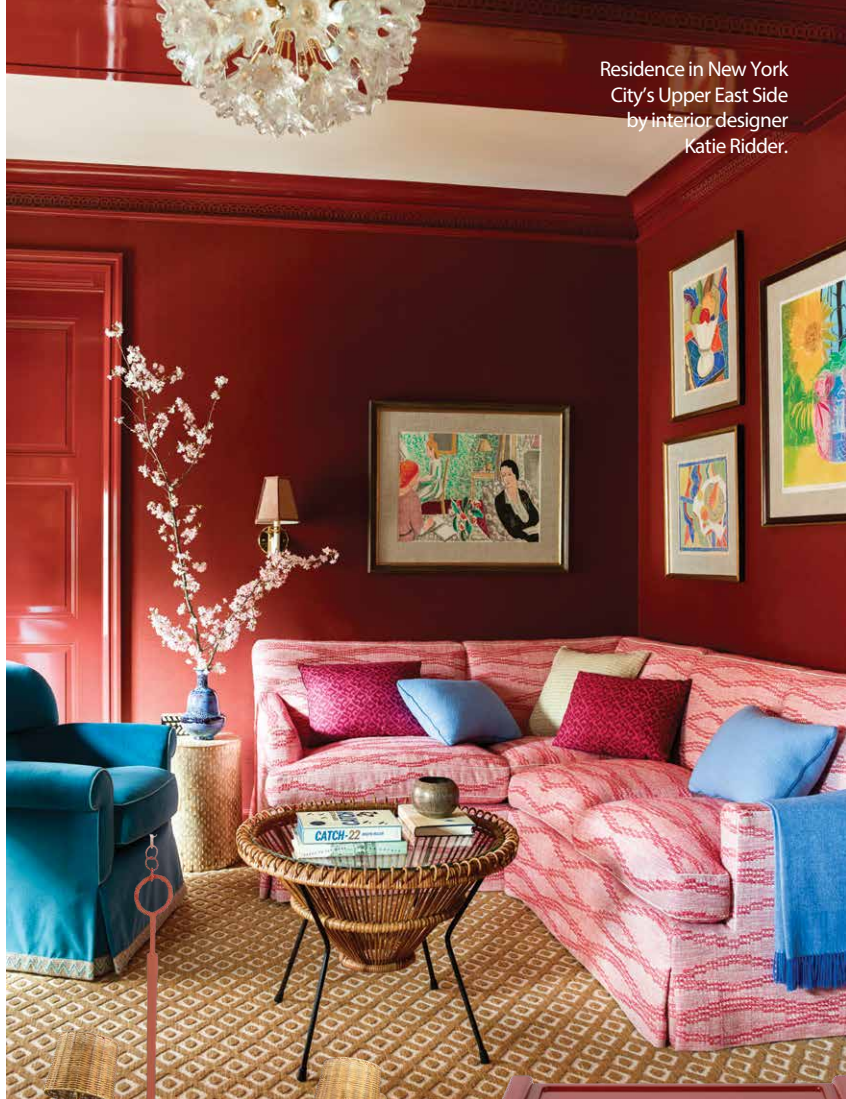
Residence in New York City's Upper East Side by interior designer Katie Ridder.

A bracing tonic of sensuously tart with a palate-cleansing sprinkle of sweet, this strikingly lush and tangy hue holds a voluptuary sophistication rich in a savory sharpness. A bejeweled ruby red zest roused from pearl-like clusters of its namesake, this piquant hue is marked by undertones of ruddy rose, muddled raspberry and rhubarb, notes of a fiery translucent orangery, and a grounding hint of spice. Spectacularly stately, the glossy acidity couples beautifully with jewel-toned sapphire, emerald, and deeply saturated neutrals such as indigo and chestnut. It is equally energized by pairings of saffron and chartreuse while softened by whispers of lilac.